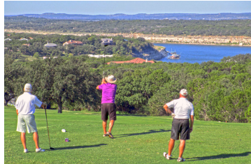
Beautiful views at every turn