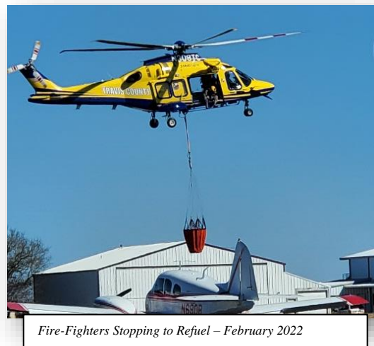
Fire-Fighters Stopping to Refuel – February 2022

Today Lago Vista has several revenue generating opportunities directly attached to the airport, in addition to its indirect economic benefits. The City's competitively priced aviation fuel draws aviators to Lago Vista from the region and attracts general aviation and charter flights on cross country trips to stop for fuel and maybe an overnight stay or a meal at one of our local restaurants. Taxiway ramp areas owned by the City generate rent revenue for designated tie-down spots where airplanes can be parked and